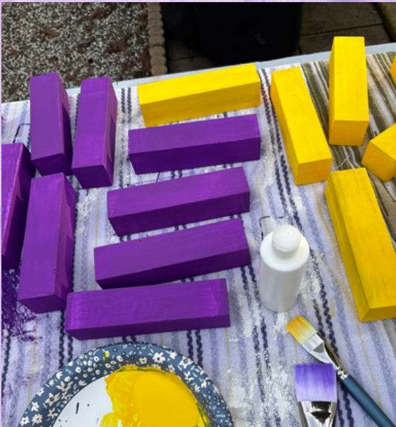
PHASE ONE OF PAINTING JENGA BLOCKS FOR OUTREACH EVENTS