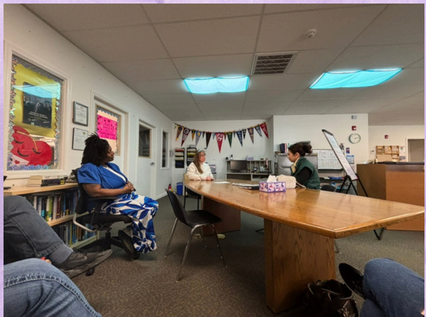
AMADOR COUNTY CHAMBER OF COMMERCE FILMING STUDENTS AND STAFF AT AMADOR COLLEGE CONNECT FOR BUSINESS SPOTLIGHTING!